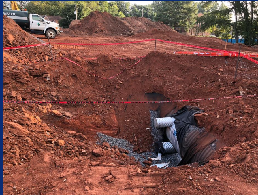
East Side Detention System Installation and Backfill