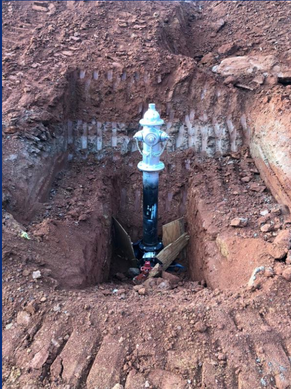
Fire Line Installation