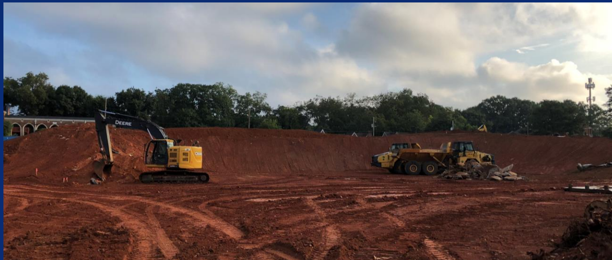
View of Project Site from Richland Road